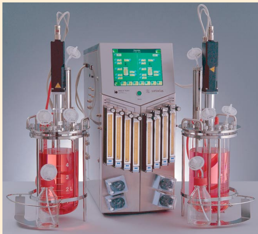
Photo 1: A dual bioreactor capable of midculture supplementation (determined by, for example, pH, dissolved oxygen, and glucose levels) using integrated pumps and time, weight, or level control (SARTORIUS BBI SYSTEMS, INC., WWW.BBRAUNBIOTECH.COM)

many advanced culturists prefer to use them sparingly in initial formulas and complement them with other metabolic cycle participants — or add them as supplements in metered doses throughout a culture.